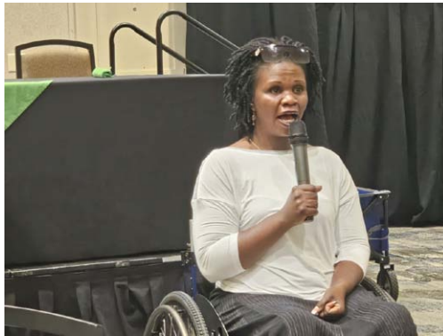
This is your Rotary Club making our community and the world a better place.